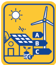
Clean Energy Transition

predecessors: Intelligent Energy Europe continued under H2020- SC3- market uptake